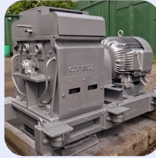
90kw Christy Norris M/S Hammer Mill Stock Ref; ND-13562-11