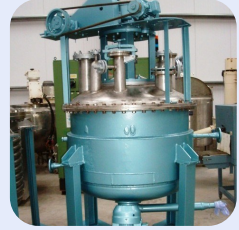
900L S/S Jktd Reactor Shearhead Mixer Stock Ref; N7201-01