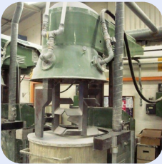
1,000L Drais Vacuum Planetary Mixer Stock Ref; N10241-09