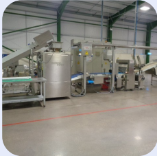
Rondo Doge LaminaZione Sheeter Stock Ref; ND-13361-24