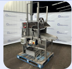
4 Roll S/S Peanut De-Husker Stock Ref; N9511-24