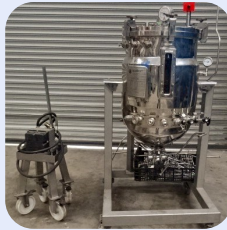
130L Mammalian Cell Fermenter Stock Ref; ND-12889-01