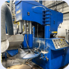
1,200L Zenelli Combination Trifoil Sawtooth Mixer Stock Ref; ND-14156-03