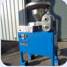
Alexanderwerk Compactor Stock Ref; N9902-49