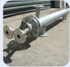
1.4 Sq Shell & Tube Heat Exchanger Stock Ref; N9318-19