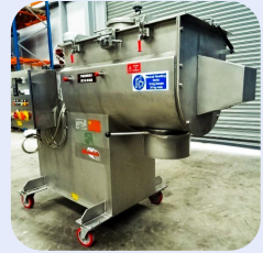
240L S/S Jktd Winkworth U-Trough Mixer Stock Ref; ND-13476-10