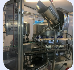
1L Bottle Filling Line - 60 to 110 BPM Stock Ref; ND-13559-23