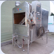
APV Whey Cascade Filter Stock Ref; ND-12829-24