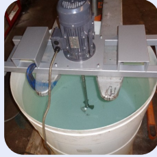
Drum/ IBC Stirrer 1.5kw Stock Ref; ND-12685-03