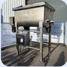
1,800L S/S Iozzelli Twin U-Trough Mixer Stock Ref; ND-13767-10