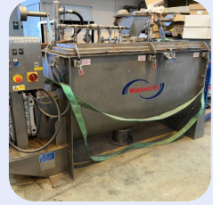
1,000L S/S Winkworth U-Trough Mixer Stock Ref; ND-14181-10