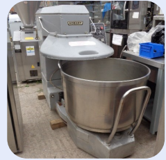
100L S/S Hobart Spiral Mixer Stock Ref; ND-13384-09