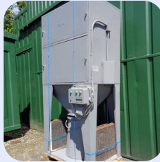
Unimaster UMA253G3 Stock Ref; ND-13221-40