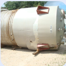
25,000L S/S 1/2 Coil Enclosed Mixer Stock Ref; N10435-01