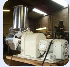
1kw Pelletiser Stock Ref; S8838-59