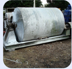
3,750L Jktd Ball Mill Stock Ref; N10066-12