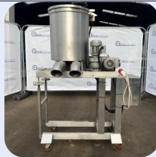
S/S Twin Head Depositor Stock Ref; ND-11728-24