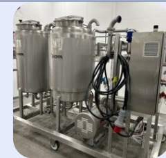
Inoxpa Cleaning System Stock Ref; ND-13870-24