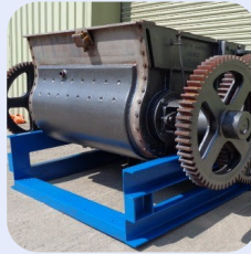
450L S/S Winkworth Jktd Z Blade Mixer Stock Ref; N8030-09