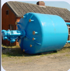
16,000L M/S Rubber Lined Mixing Vessel Stock Ref; N110343-33