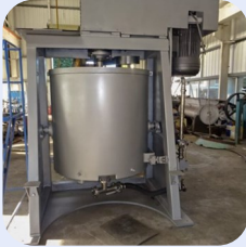
200L S/S R&B Jktd Attritor 37kw Stock Ref; ND-14122-12