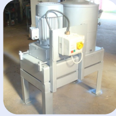
Orbital Pellet Press Stock Ref; N10282-49