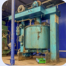
100L S/S Chamber Jktd Torrance Attritor Stock Ref; ND-13842-12