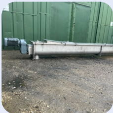
S/S U Section Conveyor 400mm Dia Stock Ref; ND-14009-39