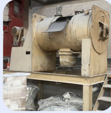
1,000L S/S Jktd Lodige Plough Shear Mixer Stock Ref; ND-14068-10