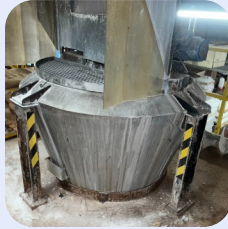
1,000L S/S Conical Nauta Type Mixer Stock Ref; ND-14054-10