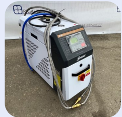
9kw Shini Oil Heater Stock Ref; ND-13553-03