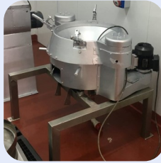
510mm Dia Russell Compact S/S Sieve Stock Ref; ND-12480-16