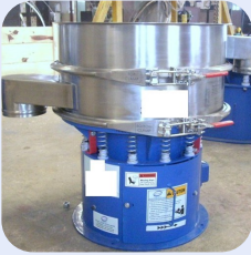
570mm S/S New Single Deck Sieve Stock Ref; RC1263A-16