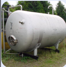
7,800L S/S Horizontal Pressure Tank Stock Ref; N8869-05