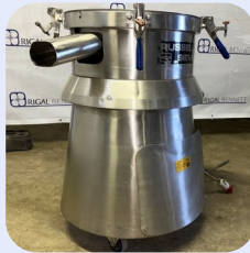
600L Rayneri Vacuum Planetary Mixer Stock Ref; N10420-09