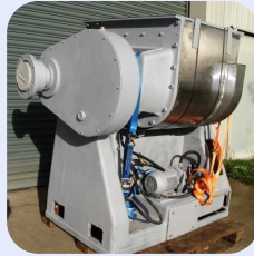
200L S/S Jktd Baker Perkins Z Blade Mixer Stock Ref; 11407