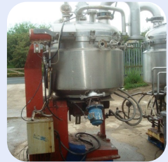
500L Unitron Scraped Tilting Cooker Mixer Stock Ref; N6955-01