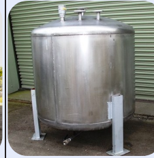
1,000L S/S Vertical Enclosed Tank Stock Ref; ND-11636-07