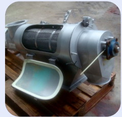
KEK Rotary S/S Sifter Type K406 Stock Ref; ND-11919-16