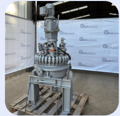
50L GLS Pfaudler Reactor Stock Ref; ND-12578-01