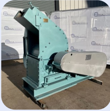
30kw M/S Christy Turner Swing Hammer Mill Stock Ref; ND-13770-11