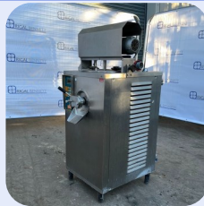
20L Promag Ice Cream Machine Stock Ref; ND-13783-24