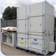
DCE Unimaster UMA756 K18 Stock Ref; ND-13368-40