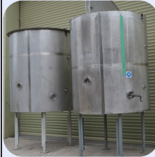
2,200L S/S Jktd Enclosed Mixing Tank Stock Ref; N10943-04