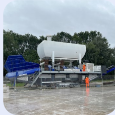
BeCoMac Mobile High Speed Blender Stock Ref; CPL-13974-70