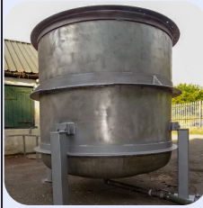
2,200L S/S Open Top Tank Stock Ref; ND-13552-07