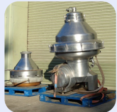
Alfa Laval 30kw Disc Centrifuge Stock Ref; ND-12828-17