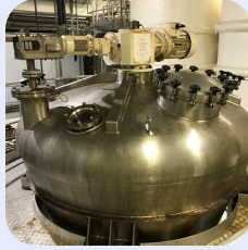
4,000L S/S Hosokawa Micron Conical Mixer Stock Ref; ND-13914-10