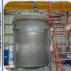
5,000L S/S Halar Lined Mixing Vessel Stock Ref; ND-13418-02