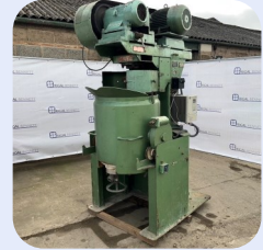
50L S/S Torrance Jktd Attritor Stock Ref; ND-12543-12