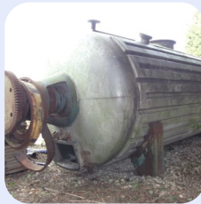
6,000L Buss S/S Paddle Vacuum Drier Stock Ref; N7395-13