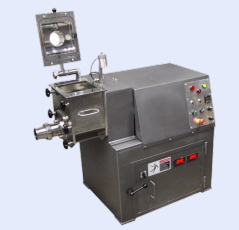
10L S/S Mixtruder Jktd Z-Blade Mixer 2.2kw Stock Ref; RBP-15-09