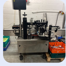
Sessions UK Double Sided Labeller Stock Ref; ND-14026-23