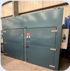
9,000L Hedinair M/S Electrically Heated Oven Stock Ref; ND-13868-13