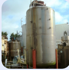
20,000L S/S Fermentation Mixing Vessel Stock Ref; N10751-07