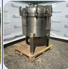
650L S/S Euro-Vent Pressure Vessel Stock Ref; ND-13964-05