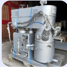
30L S/S Molteni Jktd Planetary Mixer Stock Ref; ND-13526-09