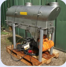
0.3 Sq.M Nirol Continuous S/S Fluid Bed Drier Stock Ref; ND-12200-13