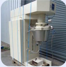
Fryma Koruma M/S Ball Mill Stock Ref; ND-12901-12