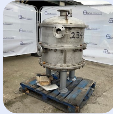
2.3 Sq.M. S/S Pressure Leaf Filter Stock Ref; CPL-13974-70