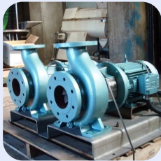
2,500 LPM M/S Flowserve 125-100Cpxm Stock Ref; N9933-32