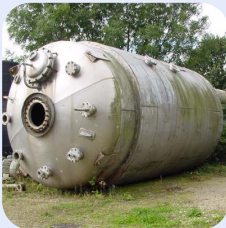
45,000L S/S 1/2 Coil Pressure Vessel Stock Ref; N7088-05