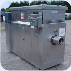
500L Iozzelli Twin Paddle Mixer Extruder Stock Ref; N9201-09