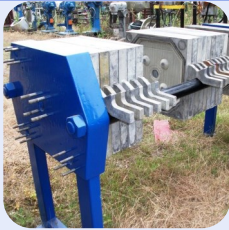
Andritz Polypropylene Filter Press 470mm Stock Ref; 12235-18