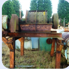
Double Rotor Hammer Mill 80 T/Hr Stock Ref; N4843-11