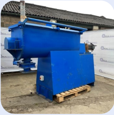
500L S/S Winkworth U-Trough Mixer Stock Ref; N9941-10