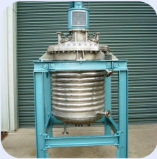
520L S/S Limpet Coiled Reactor Flameproof Stock Ref; N8480-01