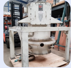
British Rema Opposed Jet Mill M/S Stock Ref; ND-13005-11