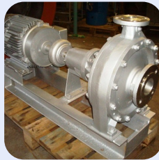
1,650 LPM W. Simpson Type 65CP250 Stock Ref; ND-13914-10