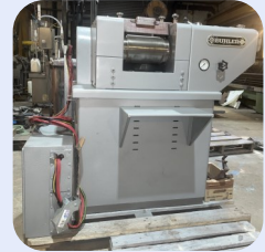
Buhler M/S Triple Roll Mill Stock Ref; ND-14049-12