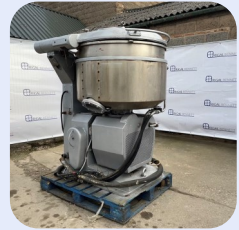
200L Unitron Scraped Tilting Cooker Mixer Stock Ref; S9773-01