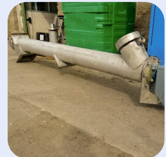
S/S Tubular Conveyor 200mm Dia Stock Ref; ND-13653-39