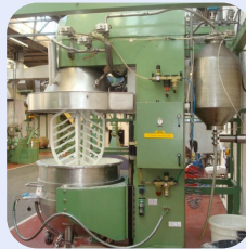
600L Rayneri Vacuum Planetary Mixer Stock Ref; N10420-09