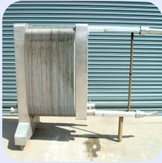
55 Sq Alfa Laval Plate Heat Exchanger Stock Ref; S8997-19