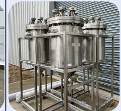
240L S/S Jktd Vertical Pressure Vessels Stock Ref; ND-13166-05