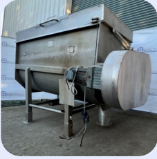
1,000L S/S Polar U-Trough Mixer Stock Ref; ND-13770-11