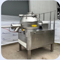
250L S/S Jktd High Shear Mixer Granulator Stock Ref; ND-13352-09