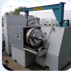
Buhler S/S Horizontal Jktd Bead Mill 38kw Stock Ref; ND-13378-12