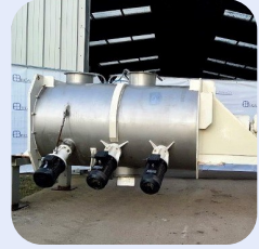
1,300L S/S Lodge Plough Shear Mixer Stock Ref; ND-13743-10