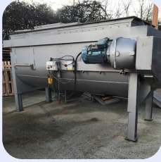
4,300L M/S U-Trough Mixer 22kw Stock Ref; ND-12120-10