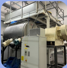
1,660L S/S Jktd Kek Plough Shear Mixer Stock Ref; ND-13927-10