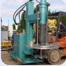
45kw Dispersion Mixer Stock Ref; N9577-03