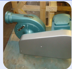
Secomak High Velocity Stock Ref; N10560-29