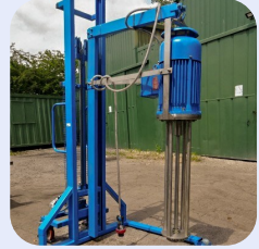
11kw Shearhead Mixer Stock Ref; ND-13553-03