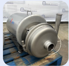
980 LPM APV Centrifugal Pump Stock Ref; ND-12626-33