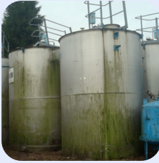
20,000L S/S Vertical Tank Stock Ref; N10393-07