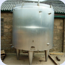
5,500L S/S Jktd Enclosed Mixer Stock Ref; N10522-04