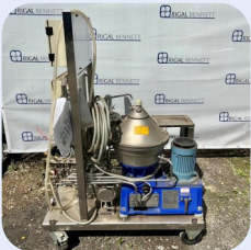
Alfa Laval Lab Centrifuge Model 404 SGP-31G Stock Ref; ND-14156-03