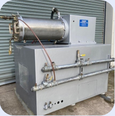
60L Eiger Torrance S/S Horizontal Jktd Bead Mill Stock Ref; ND-13213-12