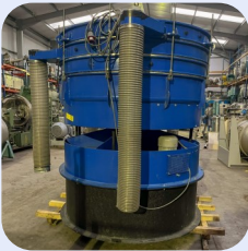
Allgier Three Deck Sieve M/S 1,800mm Dia Stock Ref; ND-13759-16