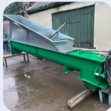
M/S U Section Conveyor 380mm Dia Stock Ref; ND-13959-39