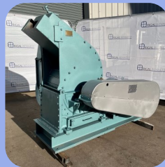
30kw M/S Christy Turner Hammer Mill Stock Ref; ND-13770-11