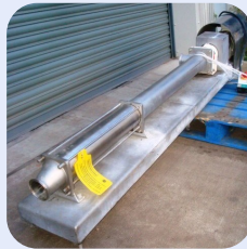
80 LPM S/S Mono Pump Type SS052/MS1RS Stock Ref; N10727-34