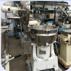
80L S/S Jktd Cutter Cooker Vacuum Mixer Stock Ref; ND-12796-24