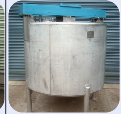
1,000L S/S Enclosed Mixing Tank Stock Ref; N9434-07