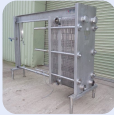
35 Sq Plate Pasteuriser Heat Exchanger Stock Ref; ND-12825-19