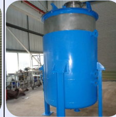
2,100L S/S Jktd Mixing Tank Stock Ref; N9064-01