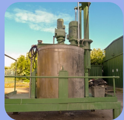
2,000L S/S Combination Mixer Stock Ref; ND-13523-03