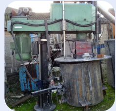
24kw Sawtooth Dispersion Mixer Stock Ref; ND-13430-03