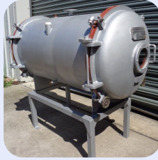
APV Mitchell Halar Lined 5 Tray Vacuum Oven Stock Ref; N8126-13