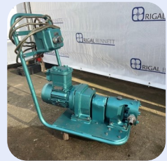
25 LPM SSP S/S Lobe Pump Stock Ref; ND-13852-34