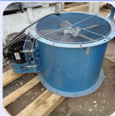
Axial Flow Port Hole Fan Stock Ref; ND-13007-30