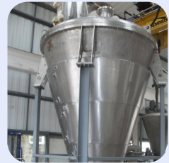
4,000L S/S Jktd Vacuum Conical Mixer Stock Ref; N10765-13