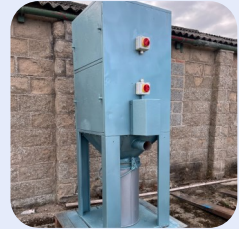
Unimaster UMA102G3 Stock Ref; N10184-40