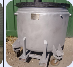
900L Giusti S/S Jktd Portable Pan Stock Ref; ND-13554-04