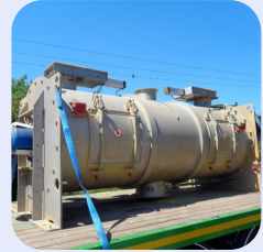
2,000L S/S Tee Blade Plough Shear Mixer Stock Ref; ND-13269-10