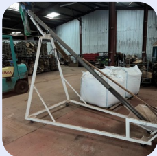
Astell M/S Auger Conveyor 90mm Dia Stock Ref; ND-14019-39