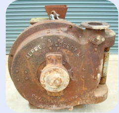
Alfred Herbert No. 6 Attritor Stock Ref; N4376-11