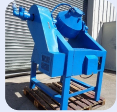
Apex S/S Double Cone Drier 40L Stock Ref; S7441-13