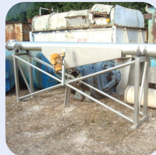
Apex Vibration Conveyor 200mm Dia Stock Ref; N9106-39