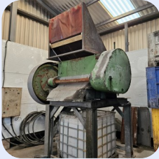
75kw Eldan Rasper M/S Granulator Stock Ref; ND-14058-11