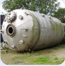
45,000L S/S Limpet Coiled Reactor Stock Ref; N7088-01