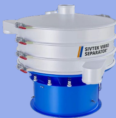
New 1,492mm S/S Twin Deck Sieve Stock Ref; RBGS602-63