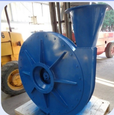
40mm Dia M/S Blower Fan Stock Ref; ND-12859-29