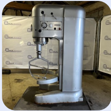
80L Hobart M802 Planetary Mixer Stock Ref; ND-13825-09