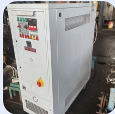
16kw Compact Oil Heater Stock Ref; ND-13350-22