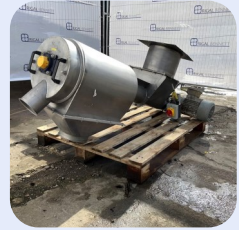
250mm Dia Le Coq S/S Rotary Sieve Stock Ref; ND-13838-16