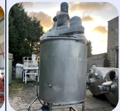
1,100L S/S Electrically Heated Jktd Mixer Stock Ref; ND-14092-01