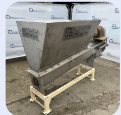
S/S U Section Conveyor 300mm Dia Stock Ref; N9500-39