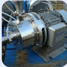
4kw S/S Moritz Inline Shear Mixer Stock Ref; N10085-03