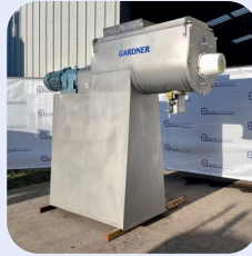
200L S/S Gardner U-Trough Mixer Stock Ref; ND-13741-10