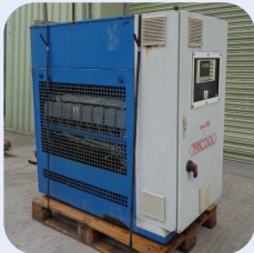
96kw Electric Oil Heater Stock Ref; BHS-12778-22