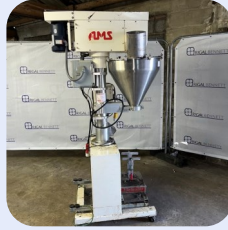
AMS S/S Semi-Automatic Auger Filler Stock Ref; ND-13810-23