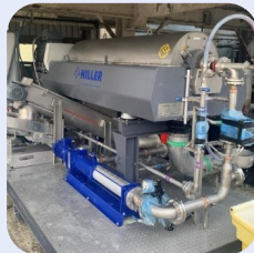
Hiller S/S Decanter Centrifuge Stock Ref; ND-14128-17