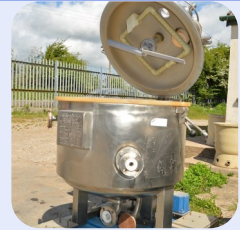
0.25 Sq.M S/S PTFE Jktd Monoplate Filter Stock Ref; N10916-18