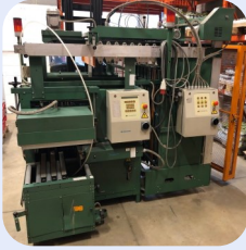
Comar Automatic Carton/ Box Erector Stock Ref; ND-13935-23